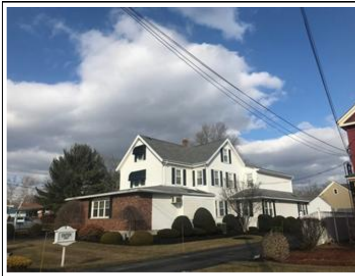
Exterior - Front

Commercial - Commercial List Price: $1,450,000