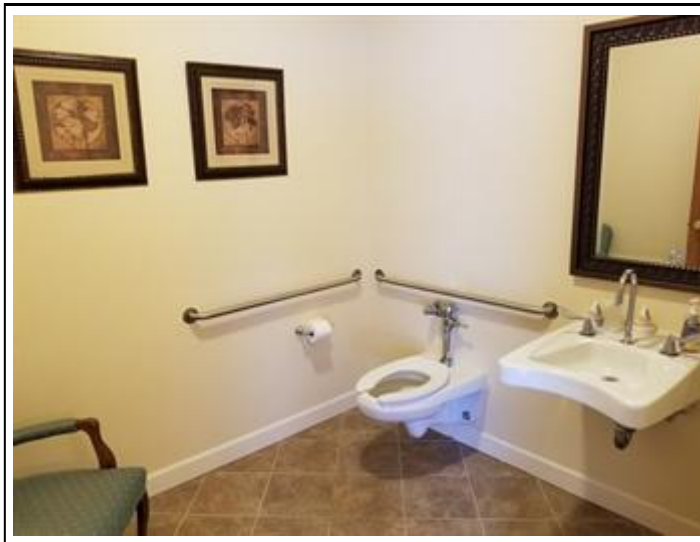
Bathroom - Half