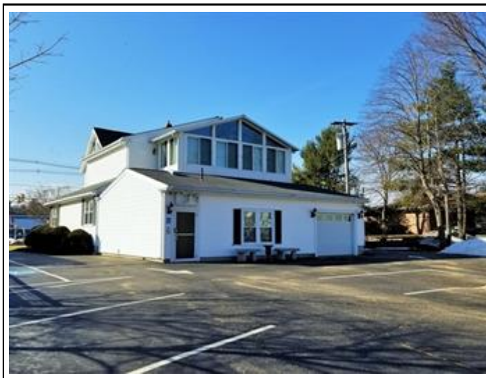
Exterior - Back