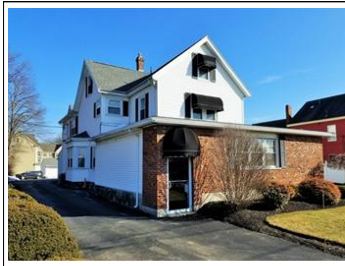
Exterior - Front