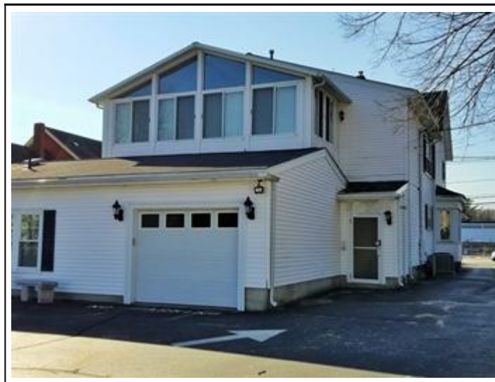
Exterior - Back