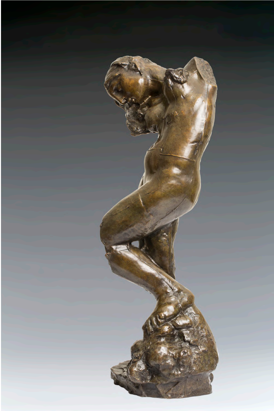
The Inner Voice at Fonderie Susse, Paris (left). Bronze.

100 Wilshire Blvd. Suite 700 Santa Monica, CA 90401 United States of America