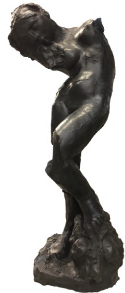
Auguste RODIN (1840-1917) The Inner Voice , wax foundry model

He then reduced it and invented new arms, many of whose terracotta and plaster studies, now in the Musée Rodin collections, were also used for the female nude known as Cybele , when she was, in turn, added to the monument.