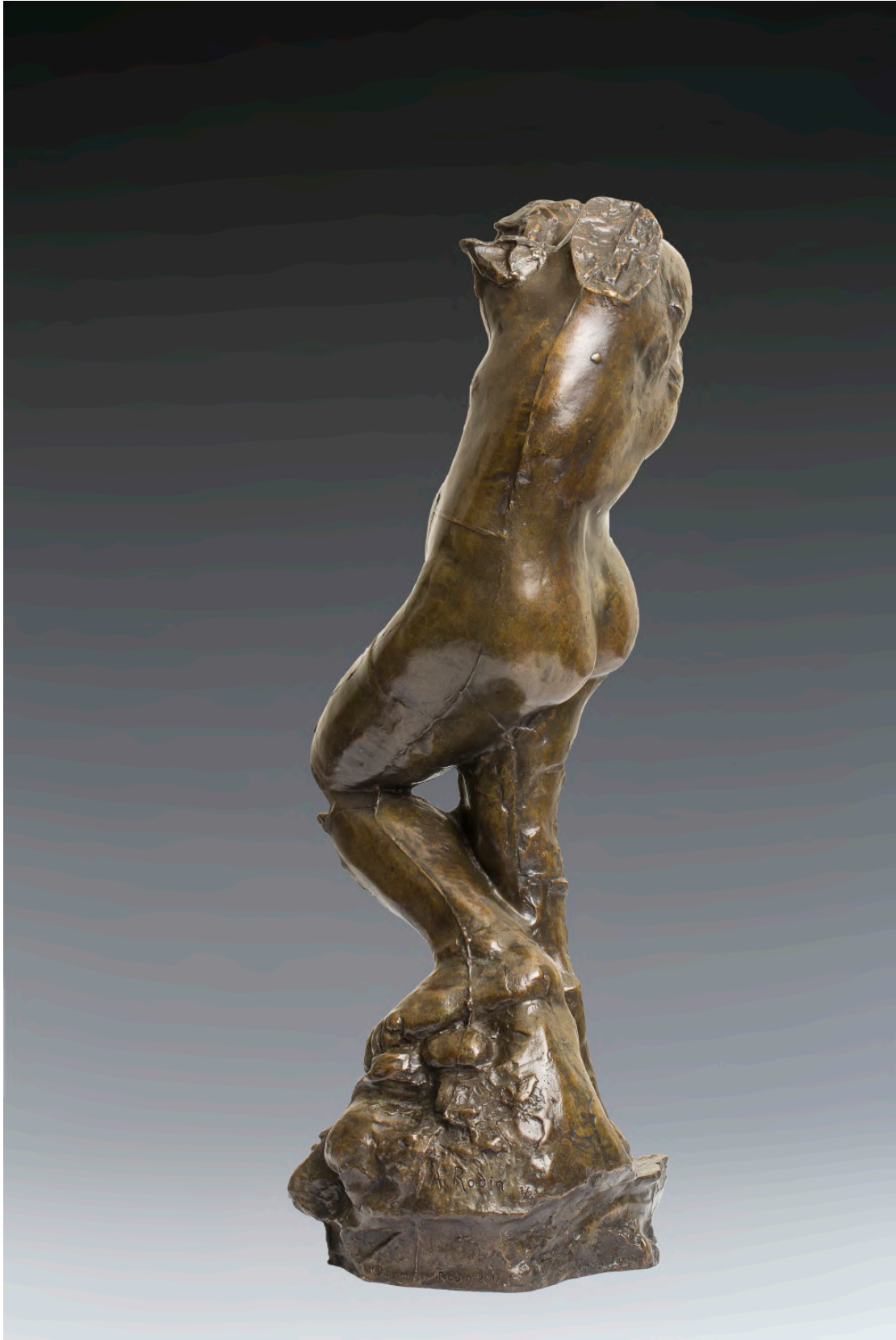
The Inner Voice at Fonderie Susse, Paris (back). Bronze.

100 Wilshire Blvd. Suite 700 Santa Monica, CA 90401 United States of America