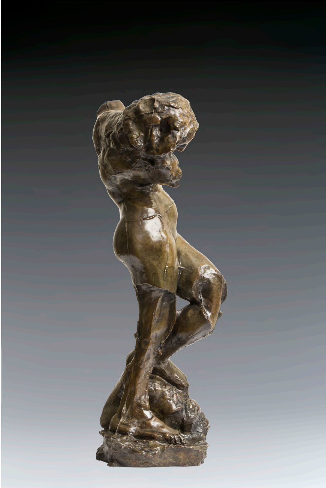
The Inner Voice at Fonderie Susse, Paris (right). Bronze.

100 Wilshire Blvd. Suite 700 Santa Monica, CA 90401 United States of America