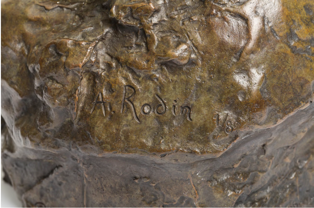
The Inner Voice at Fonderie Susse, Paris (signature & edition).