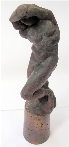
MICHELANGELO (1475-1564) Model of a slave, dark red wax on a metal armature rising from a cylindrical wood base

[Rodin] wrote to Prince Eugene of Sweden on 2 January 1897, informing him that he intended to give the cast of the figure that was going to be exhibited in Stockholm to the Swedish National Museum.