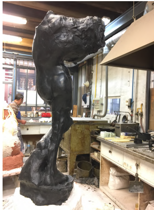
Wax model of The Inner Voice at Fonderie Susse, Paris. This model is used for the casting into bronze.