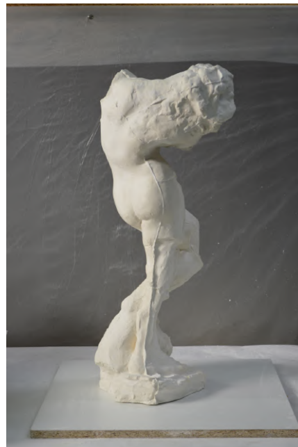
Plaster of The Inner Voice at Fonderie Susse, Paris (front & back). This plaster model is used for the casting into bronze.