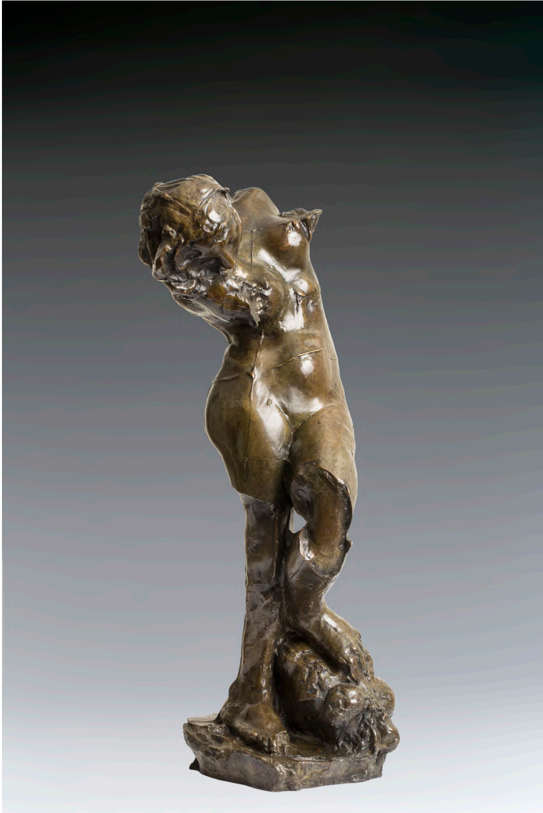
The Inner Voice at Fonderie Susse, Paris (front). Bronze.

100 Wilshire Blvd. Suite 700 Santa Monica, CA 90401 United States of America