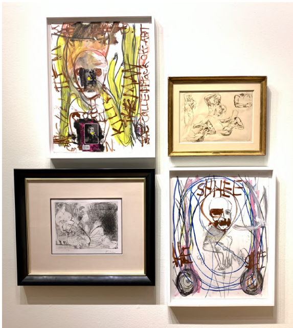
Installation view: Disruptive selection , Popcorn Gallery LA, Akim Monet Fine Arts, Fall 2019

In order to appreciate the immediacy of the present drawing, one can only imagine the lively conversation between Hiro, Weissman, and McCarthy that on the spur of the moment, fostered the creation of a set of exceptional collaborative works, this being one of the most poignant examples.