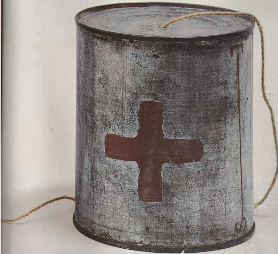
Joseph Beuys, The Multiples, A Catalogue Raisonné of multiples and prints 1965-1986, cover

Akim Monet Fine Arts, LLC 2101 Cedar Springs Rd. Ste. 1050 Dallas, TX 75201 - U. S. A.