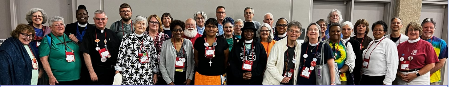
House of Deputies Deacons defending the 81st GC resolution supporting the Association for Episcopal Deacons