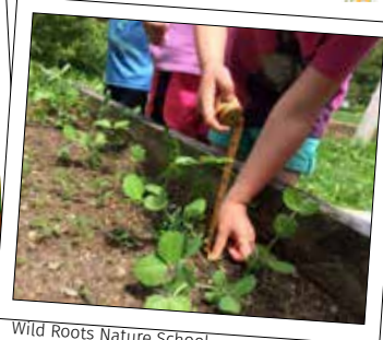
Wild Roots Nature School