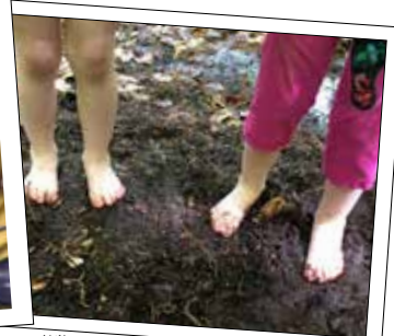
Wild Roots Nature School