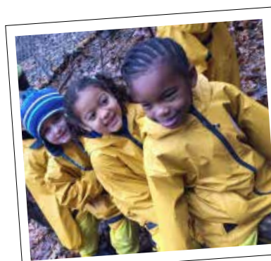
Forest Days Handbook

Children long to experience themselves as capable, purposeful, and connected. The Forest Kindergarten and Land Stewardship program at The Hartsbrook School will provide a context in which we can see, feel and discuss the role that purposeful work, movement and imagination play in supporting the essential development and wellbeing of children. Bring your Wellies, rubber boots or protective footwear of some kind – we'll be out and about!