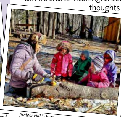
Juniper Hill School