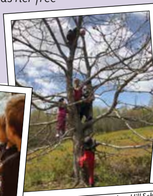
Juniper Hill School