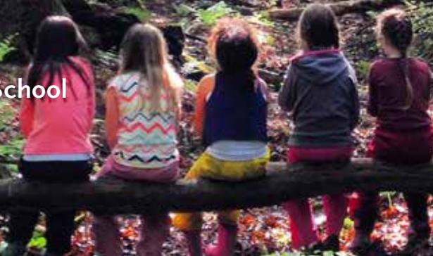
North Branch Nature Center

Saturday, June 13, 2020 Moretown Elementary School Moretown, Vermont