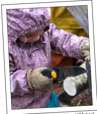
Juniper Hill School

Have you ever tried to cut an apple with a plastic knife? Real tools give real results. With intentional teaching about how to use real tools (hammers, hand drills, saws, files, peelers and such) children can improve their eye-hand coordination, increase confidence, improve safety awareness and risk assessment skills and practice self-regulation. This workshop will explore the difference between hazards and risks, and outline safety rules and routines. We'll discuss all the possible applications and you'll get to work with the tools yourself.