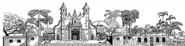
PLYMOUTH CONGREGATIONAL CHURCH