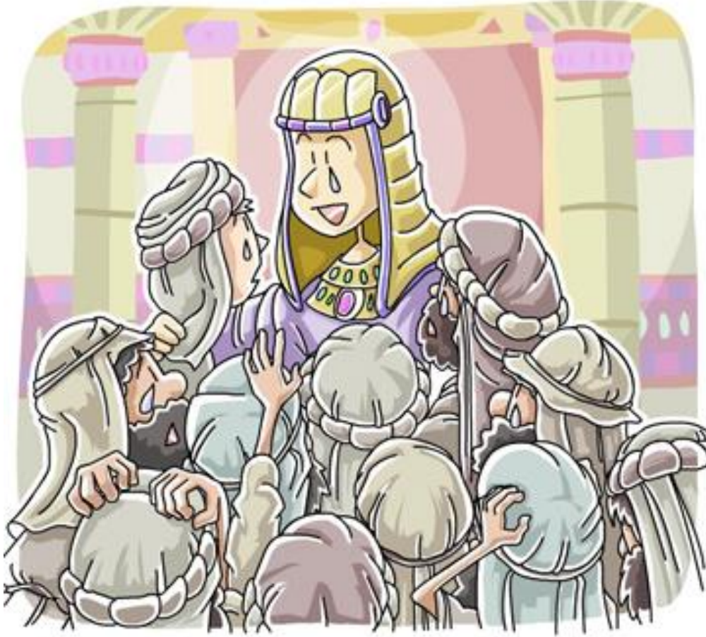
Joseph Reveals Himself to His Brothers