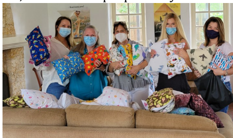
BOOM with pillows for Chapman welcome bags