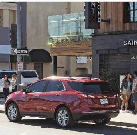
CLOCKWISE: Saint & Second restaurant is a staple of Long Beach; urban beaches let you have it all—just like the all-new Equinox.

Ride solo or as part of a tour along Lake Michigan's shore with Bike and Roll or explore inside the Prohibition-era Drake Hotel. Listen to live jazz and enjoy classic Italian dishes at Carmine's, a Gold Coast staple.