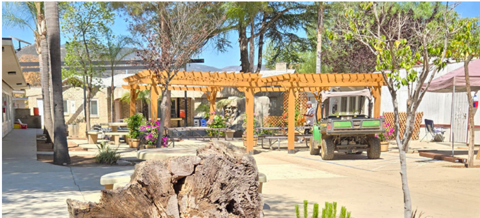
Genesis Recovery's San Diego Treatment Center

GENESIS RECOVERY is a state-licensed, non-profit, drug and alcohol rehab in San Diego devoted to restoring the lives of men afflicted with the disease and lifestyle of addiction. Its multifaceted approach to treatment draws from the most effective modalities available, including medication, clinical, 12-step, faith integration, education, and community. Genesis Recovery's long-term, highly-structured addiction recovery program fosters individual growth and lasting recovery from problematic drug and alcohol use by fostering healing of the brain, body, thinking, relationships, and sense of worth and purpose. The addiction treatment center is located just 30 minutes east of downtown San Diego in the foothills of the Cleveland National Forest.