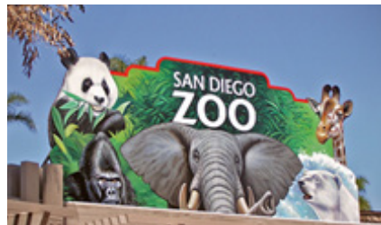
San Diego Zoo