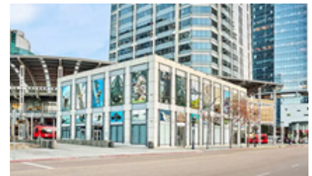
Navy SEAL Museum

We are looking forward to welcoming you to our wonderful City of San Diego and joining us for this very special event.