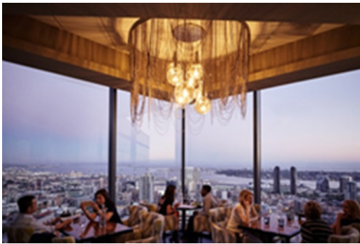
University Club Atop Symphony Towers

Another exciting evening dinner event will take place in Old Town at Casa Guadalajara, where guests will enjoy authentic Mexican cuisine, Mariachi entertainment and a festive atmosphere.