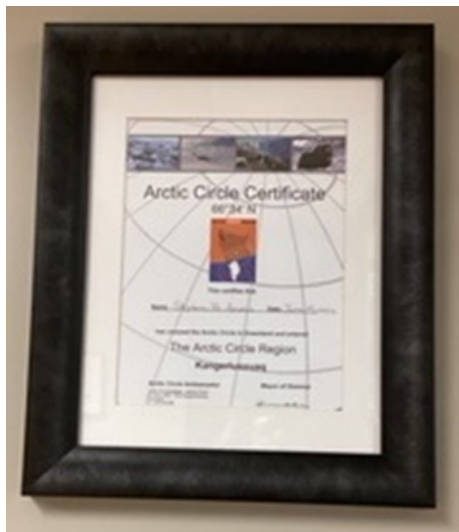
Steve Austin's Arctic Circle Certificate

It's good to see that the current administration has caught up with Swenson and Integra.