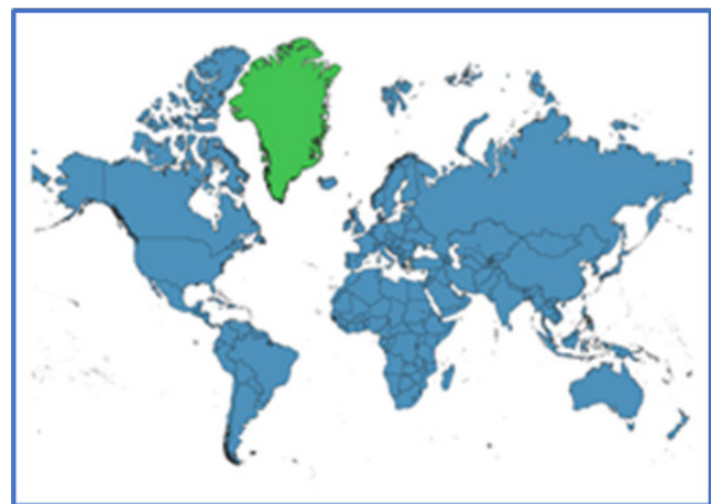
Greenland on World Map