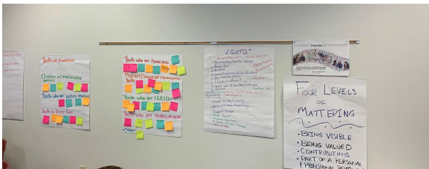
Posters from the YSP/KSA Training

Throughout September and October of 2019, a group of nearly 100 Vocational Rehabilitation (VR) Counselors from New York's Adult Career and Continuing Education – Vocational Rehabilitation agency (ACCES – VR), participated in three training modules to enhance their knowledge and skills around serving youth. The modules were selected from the YSP/KSA training curriculum offered by the Vocational Rehabilitation Youth Technical Assistance Center (Y-TAC). The YSP/KSA training modules were originally developed by the National Collaborative on Workforce and Disability for Youth , housed at the Institute for Educational Leadership (IEL), with support from the U.S. Department of Labor's Office of Disability Employment Policy. IEL and the National Youth Employment Coalition (NYEC) have updated the training content for Y-TAC to reflect the most recent information and developments in the youth service field.