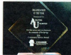
HOT SPRINGS CHAMBER OF COMMERCE ORGANIZATION OF THE YEAR 2021