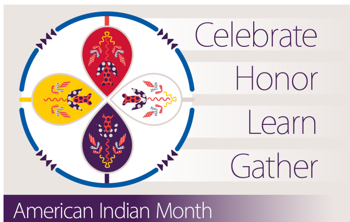
Source: May is American Indian Month in Minnesota, Hennepin County Library ( Hclib.org )

Still this month: many other events to come include canoeing celebrations on Bde Maka Ska, powwows and other gatherings. For more events and ways to celebrate all year round visit https://thecirclenews.org/events/american-indian-month-community-calendar-may-2022/ or the https://www.hclib.org/about/news/2022/May/may-is-american-indian-month-in-minnesota .