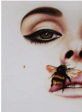
Lana Del Rey Fan Art

If you are using collaged images the work submitted must include substantial changes to the original work. Changing the medium or adjusting color does not transform the original source material.