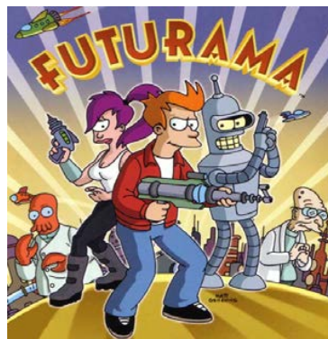
Futurama, Comedy Central