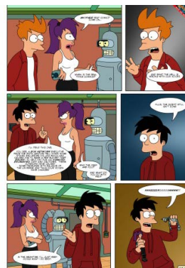
Futurama Fan Art