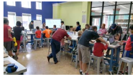
...as well as community and collaboration.

Although the Library is currently shuttered, it remains a hub of information, ideas, and innovation through greater accessibility to online resources and creative virtual activities. In a recent project, the Library and the Foundation partnered to sponsor a reading challenge – Goodnow Reads for a Good Cause – that raised funds for HOPEsudbury. This collaboration encouraged reading for all ages, while helping our neighbors in need.