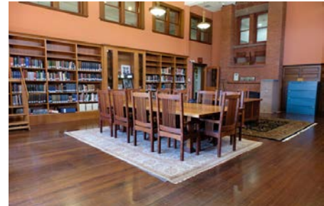
Goodnow is a place for quiet learning...