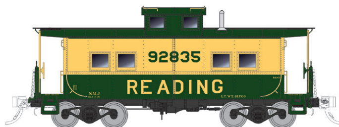
Reading - Green and Yellow