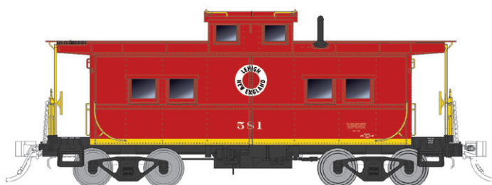
Lehigh & New England