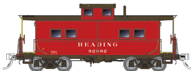
Reading - Red