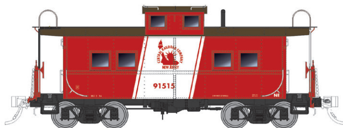
Central RR of New Jersey - Coast Guard scheme