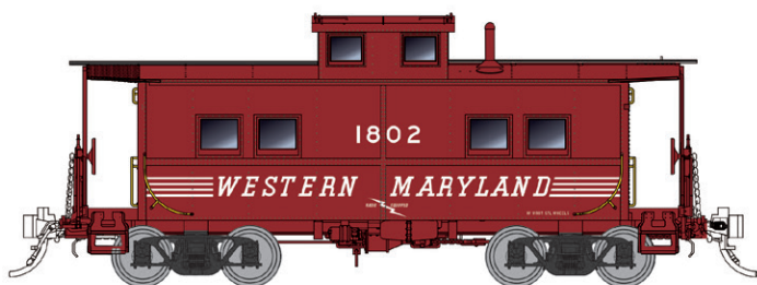
Western Maryland - Speed Lettering