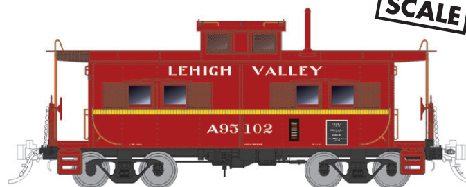
Lehigh Valley - Black Diamond