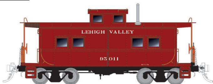
Lehigh Valley - Tuscan