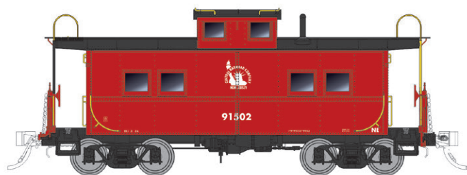
Central RR of New Jersey - Liberty Scheme