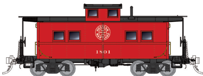
Western Maryland - Fast Freight