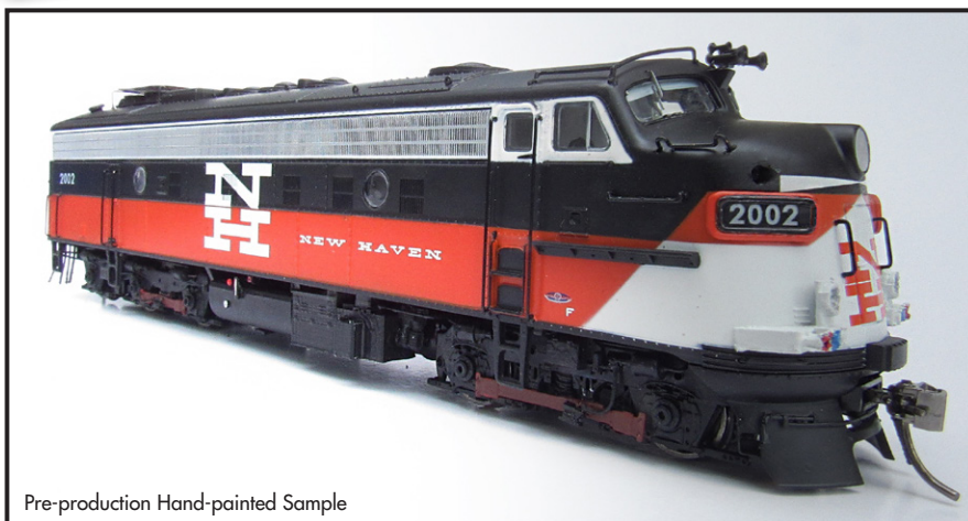
Pre-production Hand-painted Sample