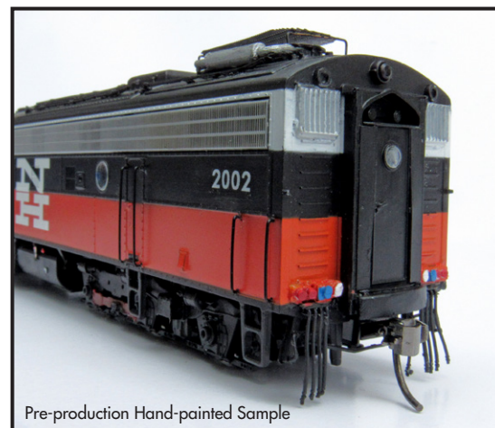
Pre-production Hand-painted Sample

The FL9 was a critical locomotive for operations out of Grand Central Terminal in New York City. Originally operated on the former New Haven lines, the operating area for the fleet expanded under Penn Central and Conrail/MTA to include the former New York Central lines north along the Hudson River.