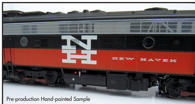
Pre-production Hand-painted Sample

Notable among these rebuilt units were those which were sold to the Connecticut Department of Transportation and were rebuilt by Chrome Crankshaft in 1984-85. Owned by ConnDot but operated by Metro North, they re-entered service wearing their original "New Haven" black, white and red livery. Metro North later also repainted two units in a fictitious but eye-catching New York Central "Lightning Stripe" scheme to celebrate the 150th anniversary of the Hudson River Railroad.