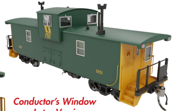
Conductor's Window on Later Versions