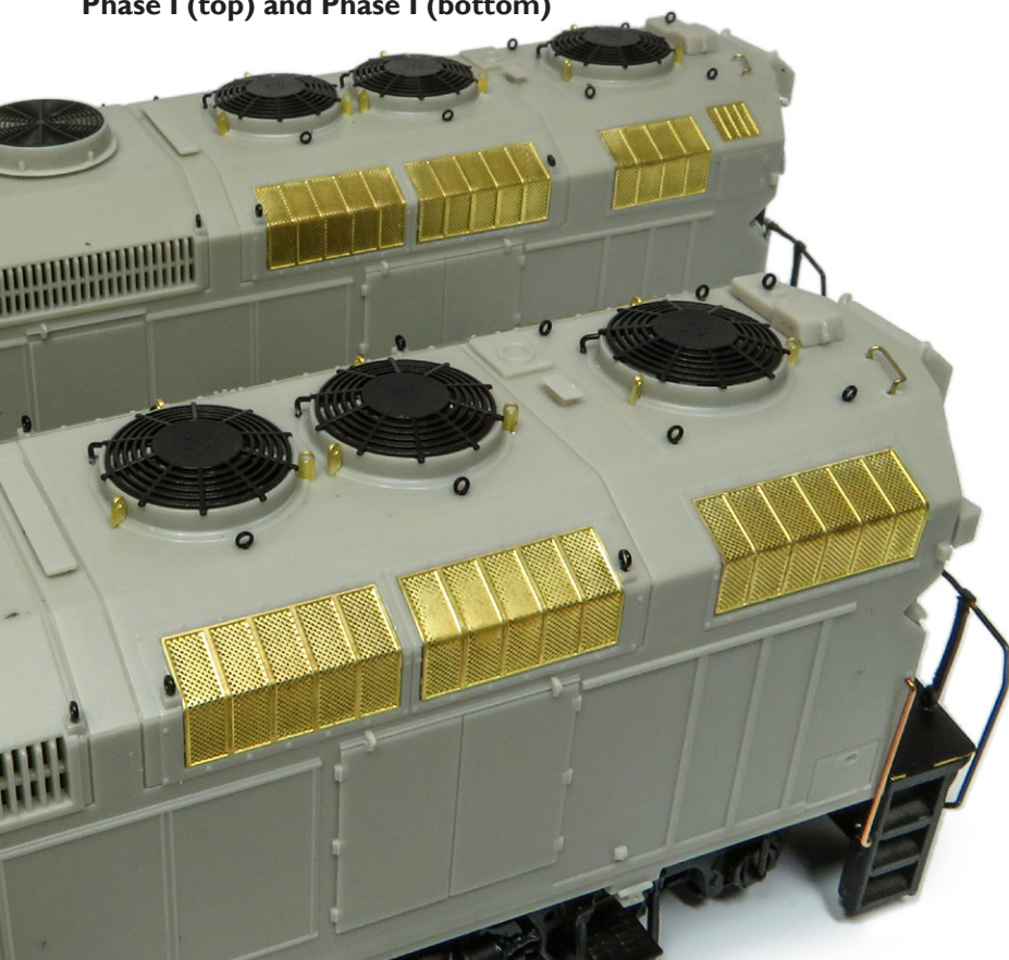
Eroded Metal Grills and Rooftop details Phase I (top) and Phase I (bottom)