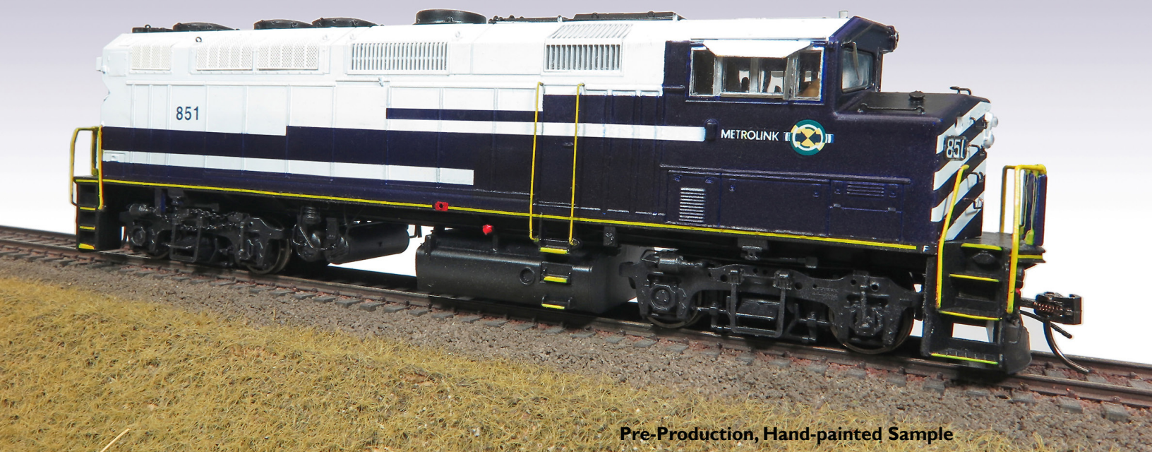
Pre-Production, Hand-painted Sample