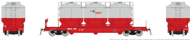
PRELIMINARY ARTWORK AND DRAWINGS. SUBJECT TO CHANGES OR REVISIONS BEFORE PRODUCTION.