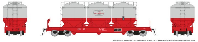
PRELIMINARY ARTWORK AND DRAWINGS. SUBJECT TO CHANGES OR REVISIONS BEFORE PRODUCTION.