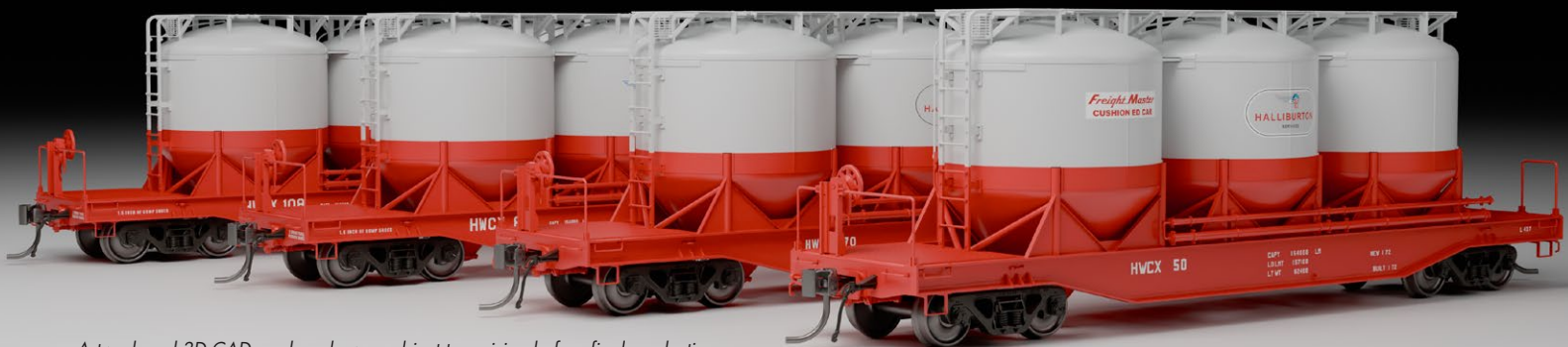
Artwork and 3D CAD renders shown, subject to revision before final production.

MSRP Single: $64.95 USD Single: $79.95 CAD ORDER DEADLINE: 6-Pack: $389.70 USD 6-Pack: $479.70 CAD MARCH 16, 2026