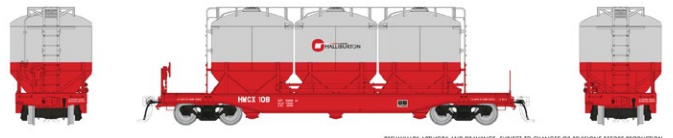
PRELIMINARY ARTWORK AND DRAWINGS. SUBJECT TO CHANGES OR REVISIONS BEFORE PRODUCTION.