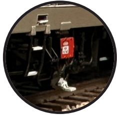
THIRD RAIL GEAR