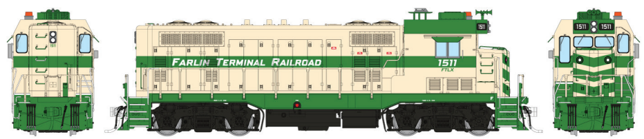
PRELIMINARY ARTWORK AND DRAWINGS. SUBJECT TO CHANGES OR REVISIONS BEFORE PRODUCTION.