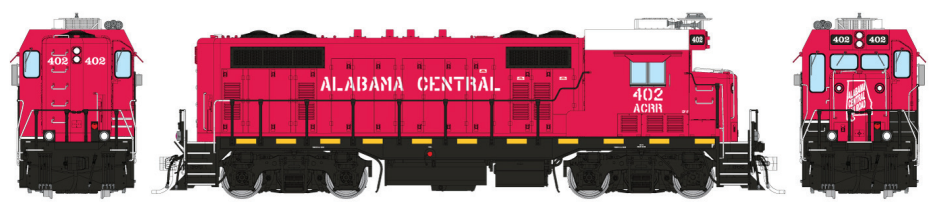
PRELIMINARY ARTWORK AND DRAWINGS. SUBJECT TO CHANGES OR REVISIONS BEFORE PRODUCTION.