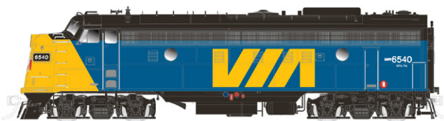
VIA Rail Canada (Early angled yellow nose)