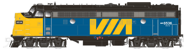
VIA Rail Canada