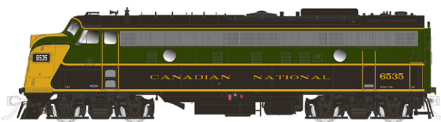
Canadian National Green & Gold

ALL MODELS LISTED BELOW ARE LIMITED QUANTITIES. THESE ARE ALREADY PRODUCED SO ONCE THEY'RE SOLD OUT, THAT'S IT.