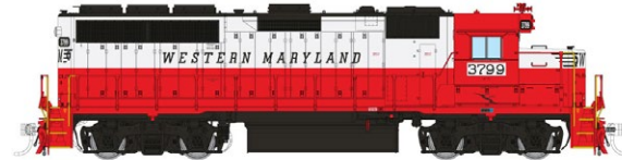
PRELIMINARY ARTWORK AND DRAWINGS. SUBJECT TO CHANGES OR REVISIONS BEFORE PRODUCTION.