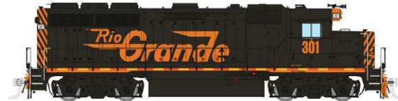
PRELIMINARY ARTWORK AND DRAWINGS. SUBJECT TO CHANGES OR REVISIONS BEFORE PRODUCTION.