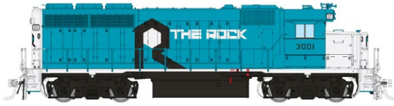
PRELIMINARY ARTWORK AND DRAWINGS. SUBJECT TO CHANGES OR REVISIONS BEFORE PRODUCTION.