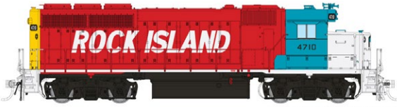
PRELIMINARY ARTWORK AND DRAWINGS. SUBJECT TO CHANGES OR REVISIONS BEFORE PRODUCTION.