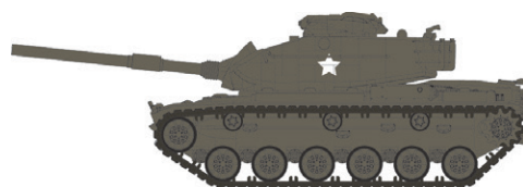
M60A1 - MERDC Winter

Item # 804002 - Single Tank $49.95 USD — $59.95 CAD