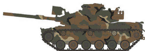
M60A1 - US ARMY

For a detailed history of these cars, check out the DODX Flatcar page on our website.