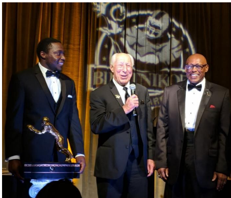
2017 Biletnikoff Award winner James Washington with Fred Biletnikoff and keynote speaker Floyd Little at the 2018 Biletnikoff Award Banquet.

For Immediate Release: November 12, 2018