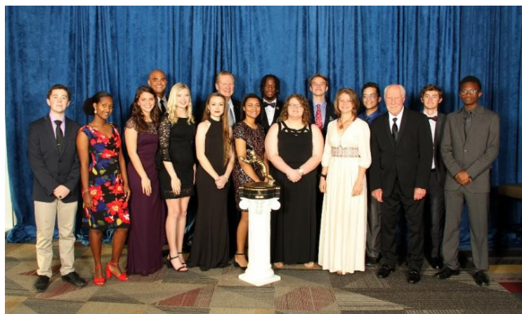
2019 Scholarship recipients

extracurricular levels. Participation in sports is not a requirement. The Foundation has provided many millions of dollars for several hundreds of scholarships and related benefits through 2019.