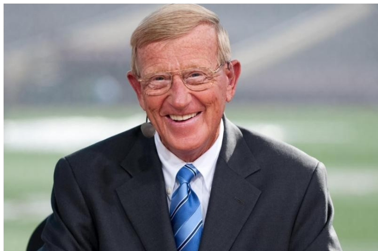
2020 Biletnikoff Award Banquet keynoter Lou Holtz

patrons at the Biletnikoff Award Banquet at the University Center Club at Doak Campbell Stadium in Tallahassee on Saturday, February 15, 2020. The banquet was hailed by 2014 keynote speaker Dick Vermeil, as well as by 2013 keynoter Larry Csonka, as "the best banquet in college sports."