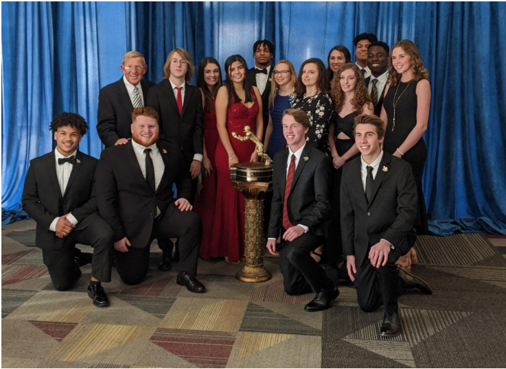
2020 Scholarship Recipients