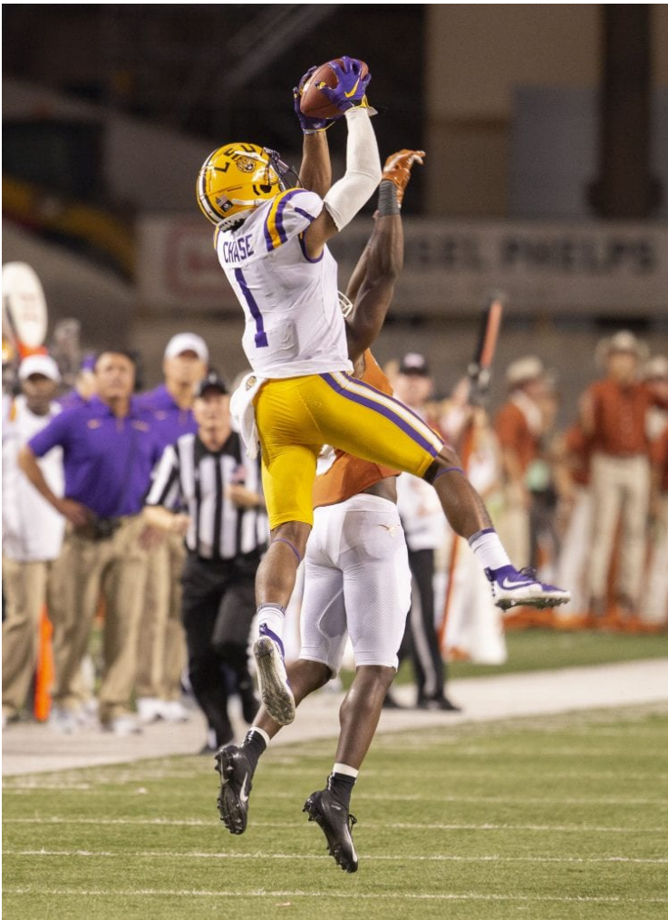
2019 Biletnikoff Award winner Ja'Marr Chase

Noteworthy is the strength of schedule of the 2020 finalists' teams as ranked by Sagarin: Alabama at 6, Ole Miss at 12, and Florida at 15. ESPN's ranking of strength of schedule has Florida at 7, Alabama at 15, and Ole Miss at 20. Moreover, according to ESPN, SEC teams played the ten most difficult schedules in college football this year, while Sagarin ranks 13 SEC teams' schedules among the 15 most difficult in 2020.