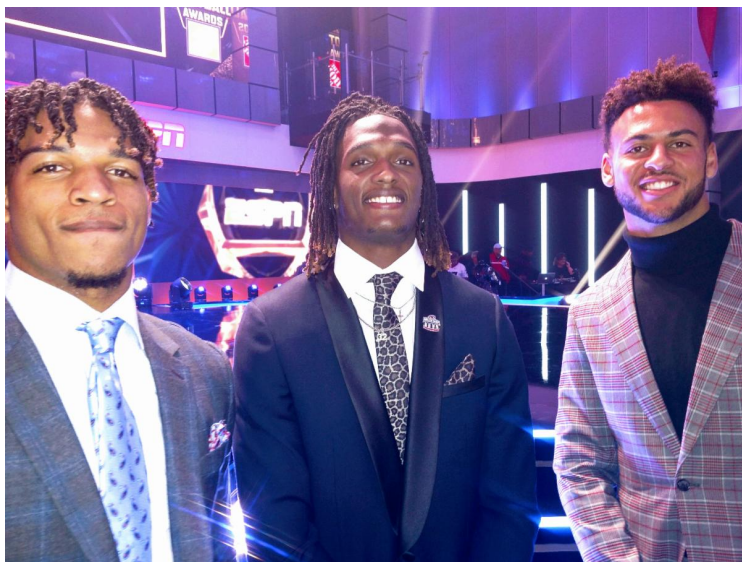
2019 Biletnikoff Award finalists: Ja'Marr Chase, CeeDee Lamb, and Michael Pittman, Jr.