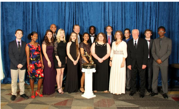
2019 Scholarship Recipients