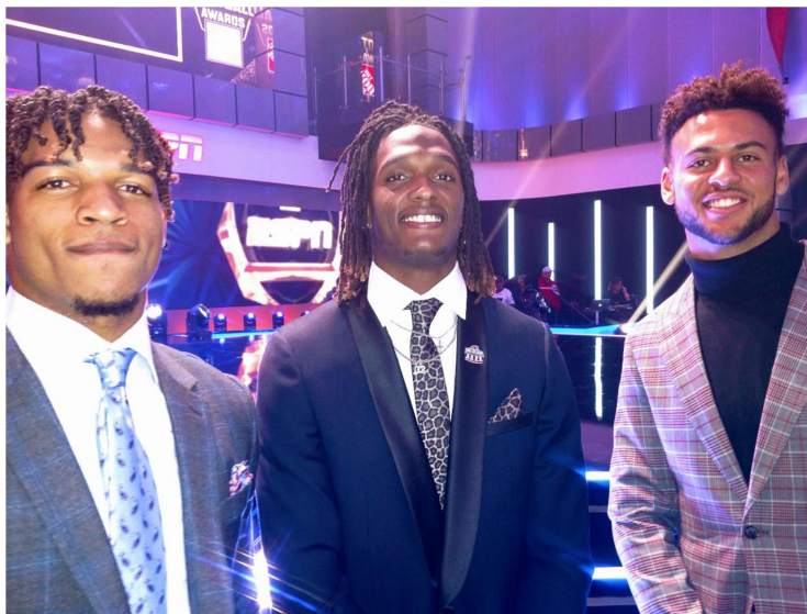
2019 Biletnikoff Award finalists: Ja'Marr Chase, CeeDee Lamb, and Michael Pittman, Jr.

The banquet has featured distinguished keynoters of profound character and accomplishments including the late Bart Starr, Dick Vermeil, Floyd Little, Larry Csonka, Steve Largent, Mike Ditka, the late Don Shula, Dan Reeves, Archie Manning, Ron Jaworski, Gene Stallings, Bob Griese, Bill Curry, Bobby Bowden, Jim Kelly, Jerry Kramer, Joe Theismann, Dan Fouts, Lou Holtz, and Aaron Taylor.