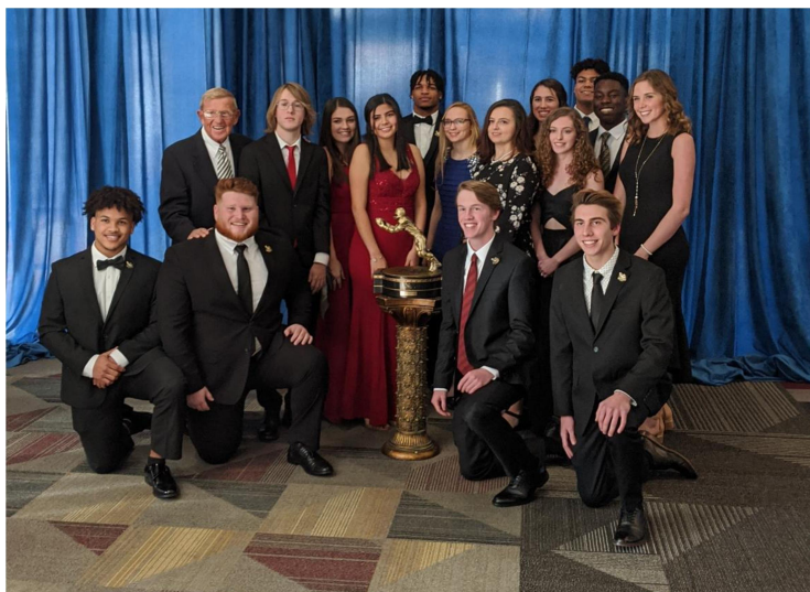
2020 Scholarship Recipients

The TQC Foundation's charitable mission is the provision of college and vocational scholarships to North Florida high school seniors who have overcome significant barriers to achieve at the highest academic and extracurricular levels. Participation in sports is not a requirement. The Foundation has provided many millions of dollars for several hundreds of scholarships and related benefits through 2020.