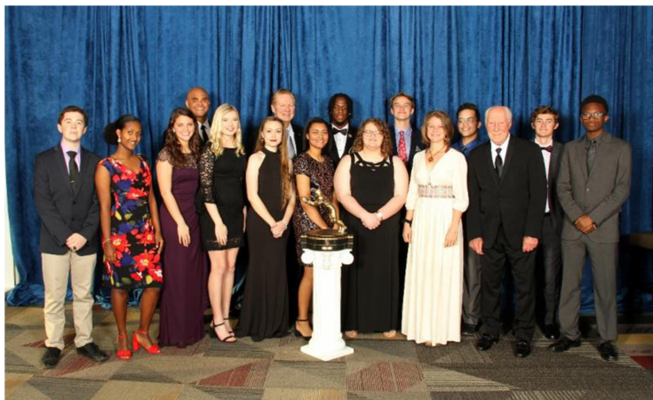
2019 Scholarship Recipients

The name Biletnikoff is synonymous with the term receiver . Fred Biletnikoff, a member of the pro and college football halls of fame, was a consensus All-America receiver at Florida State University, and an All-Pro receiver for the Oakland Raiders. He caught 589 passes for 8,974 yards and 76 touchdowns in his 14-year Raiders career from 1965 through 1978. Fred was the Most Valuable Player of Super Bowl XI.