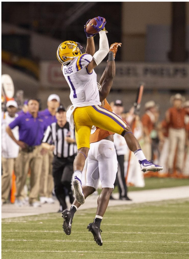
2019 Biletnikoff Award winner Ja'Marr Chase

The correlation between Biletnikoff Award winners and stardom in the National Football League is nearly uniformly consistent. Past Biletnikoff Award winners include Calvin Johnson, Randy Moss, Michael Crabtree, Amari Cooper, the late Terry Glenn, and Larry Fitzgerald.