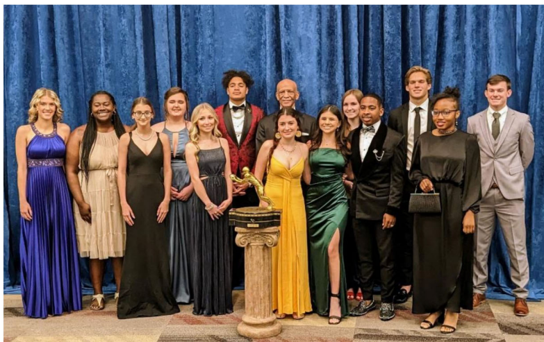
2023 Scholarship Recipients

The 2024 Biletnikoff Award semifinalists are as follows (in alphabetical order): (See below)