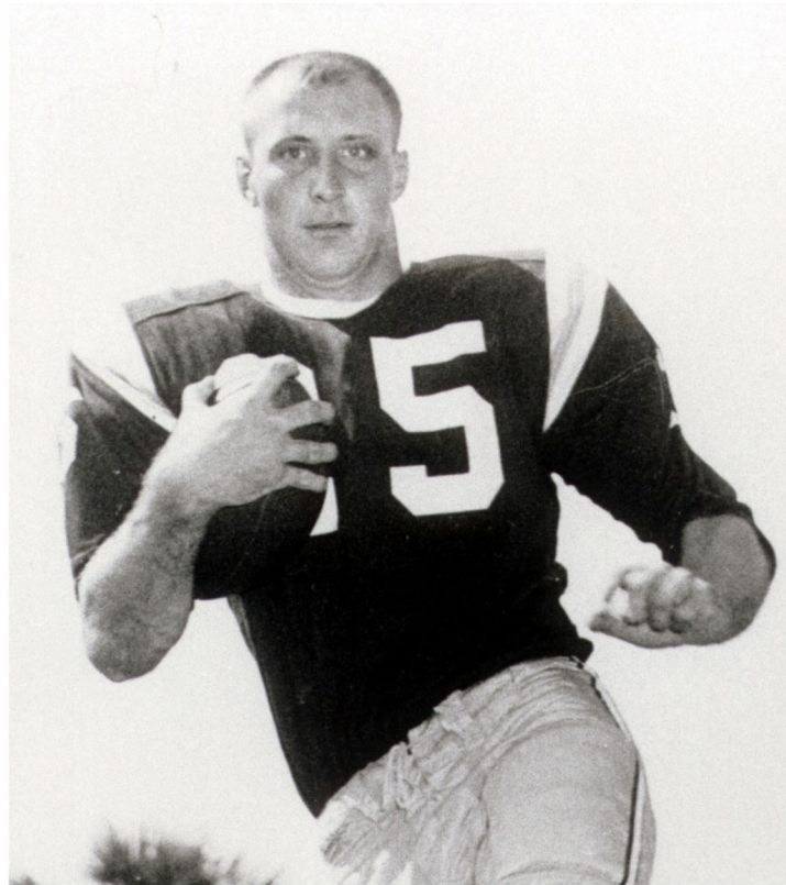
Fred Biletnikoff was Florida State's first consensus 1st-Team All-America

The name Biletnikoff is synonymous with the term receiver . Fred Biletnikoff, a member of the pro and college football halls of fame, was a consensus All-America receiver at Florida State University and an All-Pro receiver for the Oakland Raiders. He caught 589 passes for 8,974 yards and 76 touchdowns in his 14-year Raiders career from 1965 through 1978. Fred was the Most Valuable Player of Super Bowl XI.