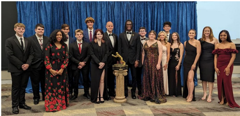
2024 Scholarship Recipients