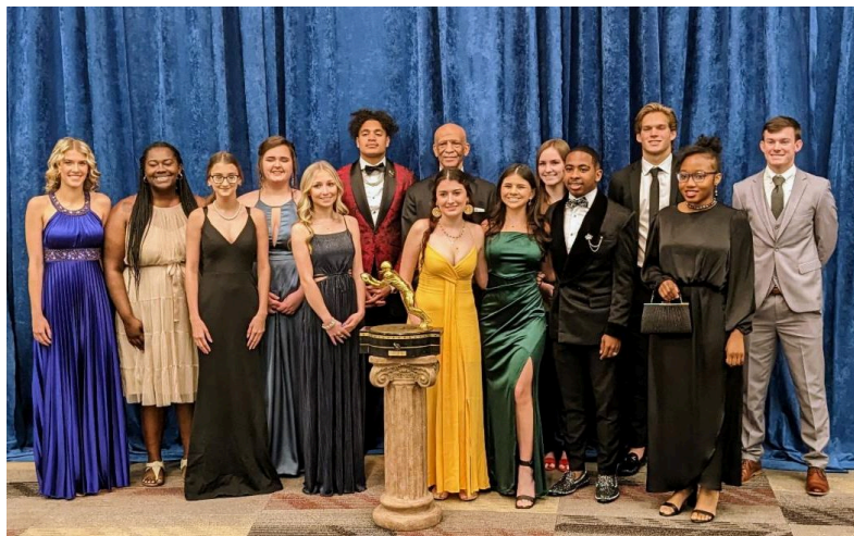
2023 Scholarship Recipients

The name Biletnikoff is synonymous with the term receiver . Fred Biletnikoff, a member of the pro and college football halls of fame, was a consensus All-America receiver at Florida State University and an All-Pro receiver for the Oakland Raiders. He caught 589 passes for 8,974