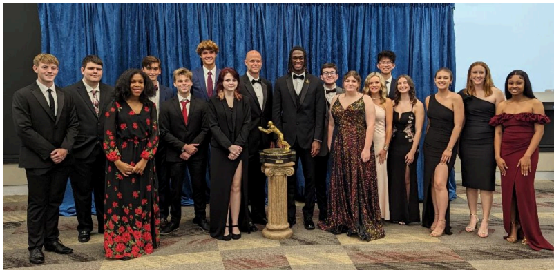
2024 Scholarship Recipients