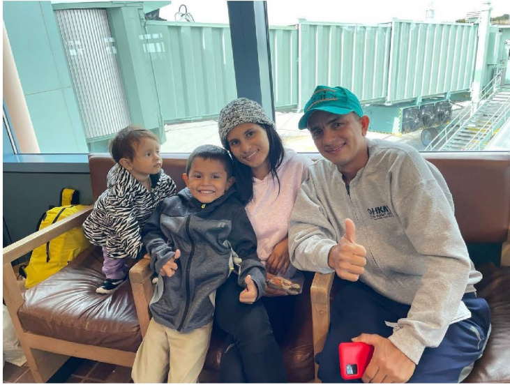
An asylum-seeking family waiting to board a plane to their sponsor. A thumb up and smiles reflect their relief, gratitude, and hope for the future.

The ABQ Asylum Seeker Welcome (AASW) wants to say thank you, thank you, thank you to the many friends who have donated money, clothing, and thousands of hours of volunteer time that allows us to be welcoming. We are wrapping up a full year of receiving asylum-seeking families. The need continues, and we will continue with your help.