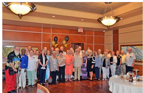
Group shot of some of the Guild members that were able to make it.