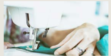
Basic Sewing & Clothing Construction