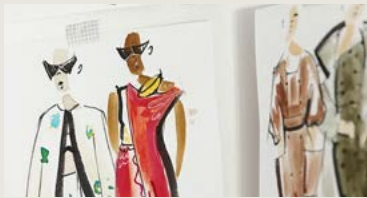
Beginning Fashion Illustration