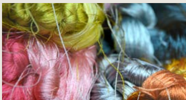
Introduction to Textiles & Fibers