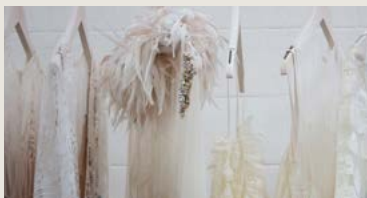
Fashion Trends & Styling