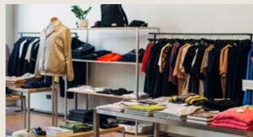
Create Your Own Fashion Brand