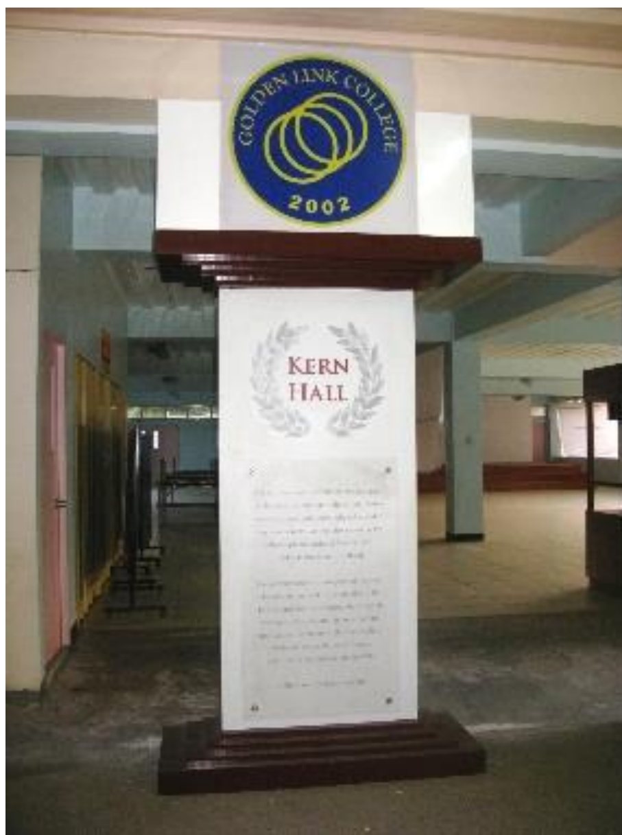
Plaque honouring the contributions of the Kern Foundation to the development of the Golden Link College