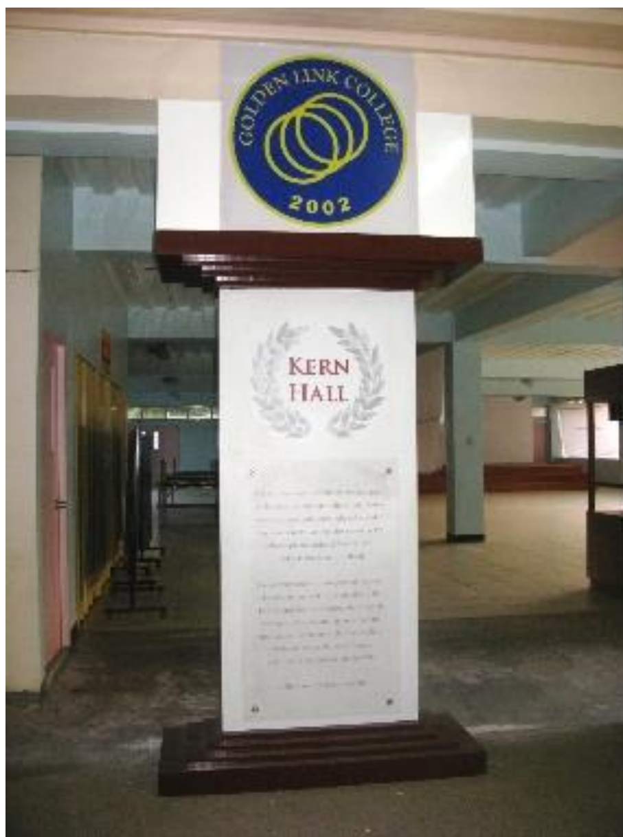
Plaque honouring the contributions of The Kern Foundation to the development of the Golden Link College