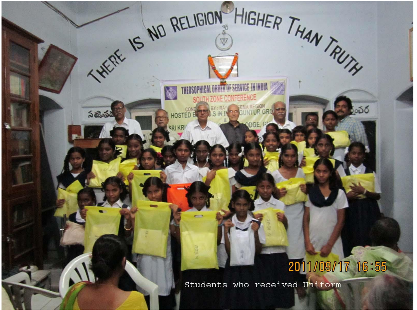
South Zone Conference at Guntur, Rayalaseema Region 2011