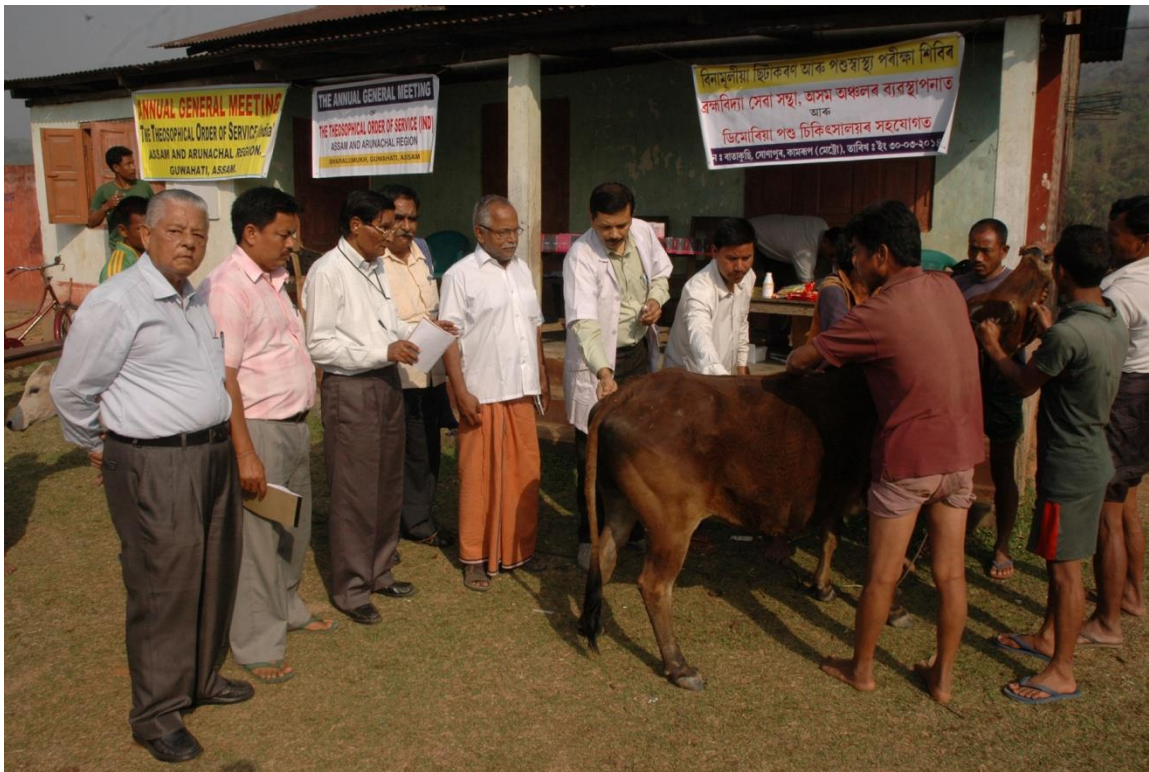
Attending a veterinary camp at Guwahati, Assam in 2013-14