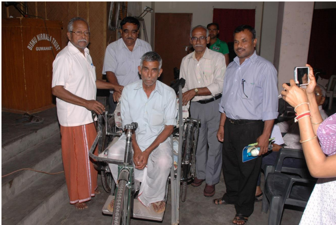
Mobility aid distribution in Guwahati, Assam, 2013-14