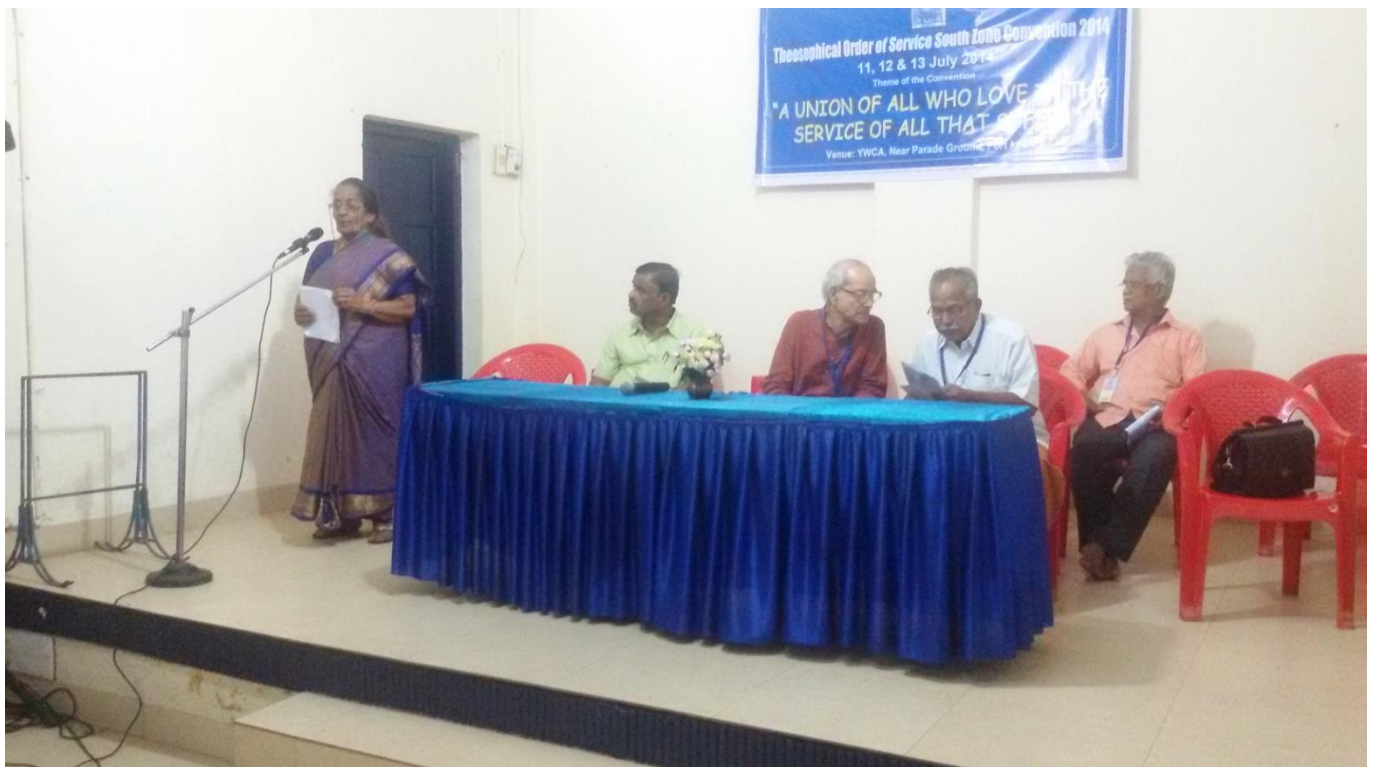
South Zone TOS Conference in Kerala 2014