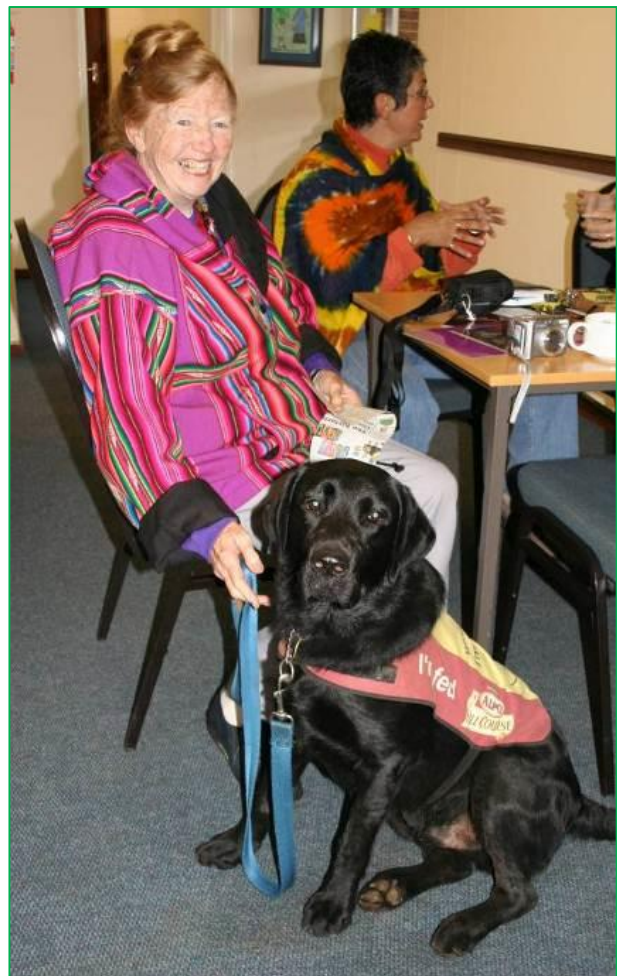
Left: The TOS in Kenya provides skills training to women, enabling them to add to the family income and gain some autonomy. At one of the sessions held at the premises of the TS in Nairobi, ladies were shown how to make cow dung cakes to use as fuel, instead of coal. The