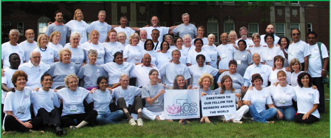
Those who serve together grow together. TOS workers at the International TOS Conference 2013 held in Wheaton, IL, USA.

Right: A trainer running a peace-building seminar for army officers assigned to Mindanao. Filipino Theosophists conduct in-depth seminars addressing two issues in particular: core commonality in religion, and dealing with one's own anger and fears regarding other people or other ethnic and religious communities.