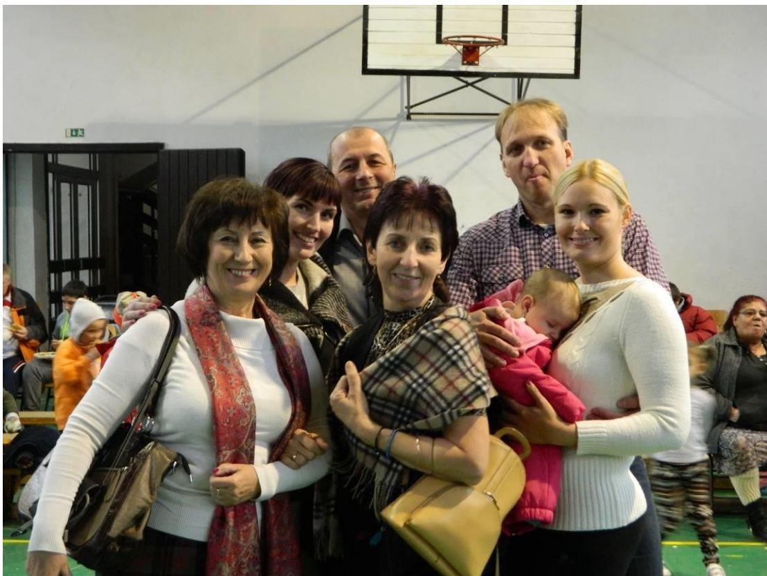
TOS members visit those in need in the village of Tápióbicske at Christmas in 2015.

► Donation of clothes (gathering, selection, delivery) to Tápióbicske and Sajópetri and to Szepsi in neighbouring Slovakia. It is not always easy to find suitable transport for the large quantity of goods gathered.