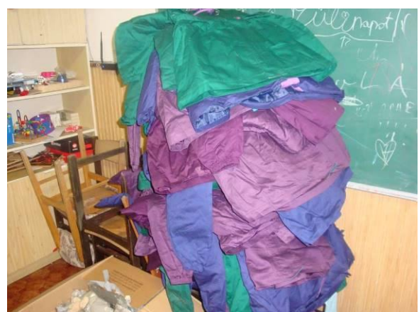
Clothing for the very poor inhabitants of a gypsy slum in Szepsi in Slovakia: