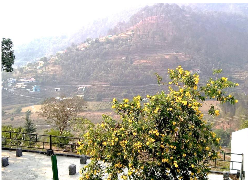
TOS camp at Bhowali