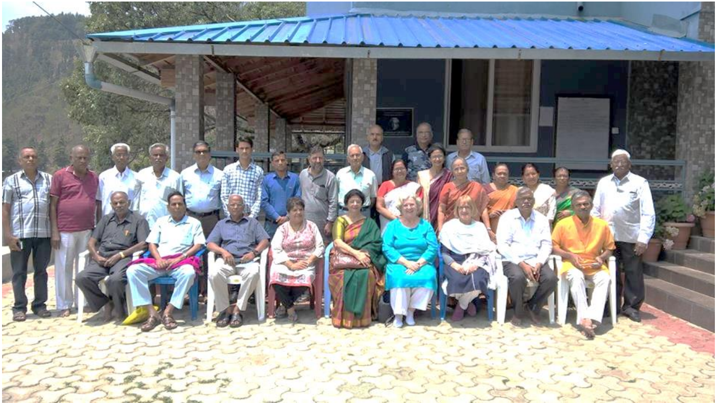
TOS camp at Bhowali – group photo