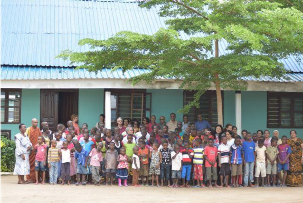
The Chanika Orphanage cares for 90 children.

Our TOS Youth Group put up a colourful banner and pictures of the Chanika Orphanage to which they would donate the proceeds of the sale.