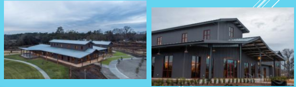
Brenton Grey Company, LLC "Firefly Distillery"