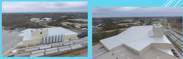
All Steel Construction, Inc. "Skaps Industries Addition"