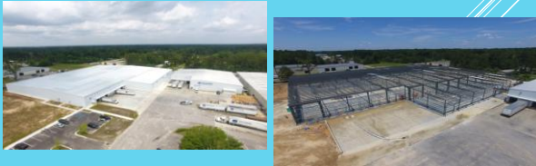
Design Build Construction, LLC "Atlantic Packaging"