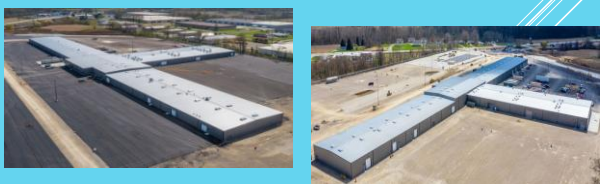
Brenton Grey Company, LLC "Carvana"