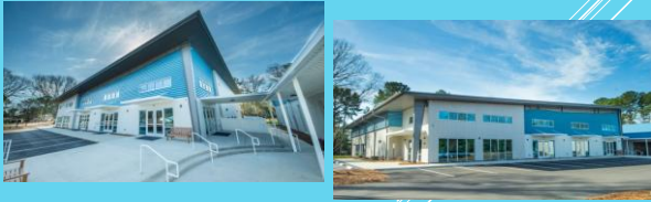
Bobbitt Design Build "Columbia Crossroads Church"