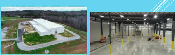
Harrell Construction "Otsuka Chemical"

After dinner, we finished out the night with the sounds of "Smokin' Hot": https://garylowdermusic.com/