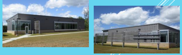
Garanco "Forsyth Tech Community College Trade Shop"