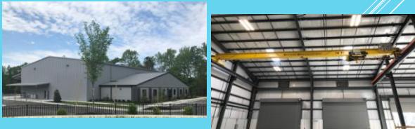
Gregory Development, LLC "KW Grading & Utilities"