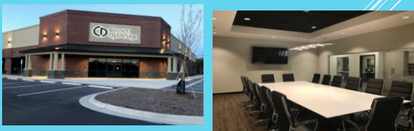
Gregory Development, LLC "Closets By Design"