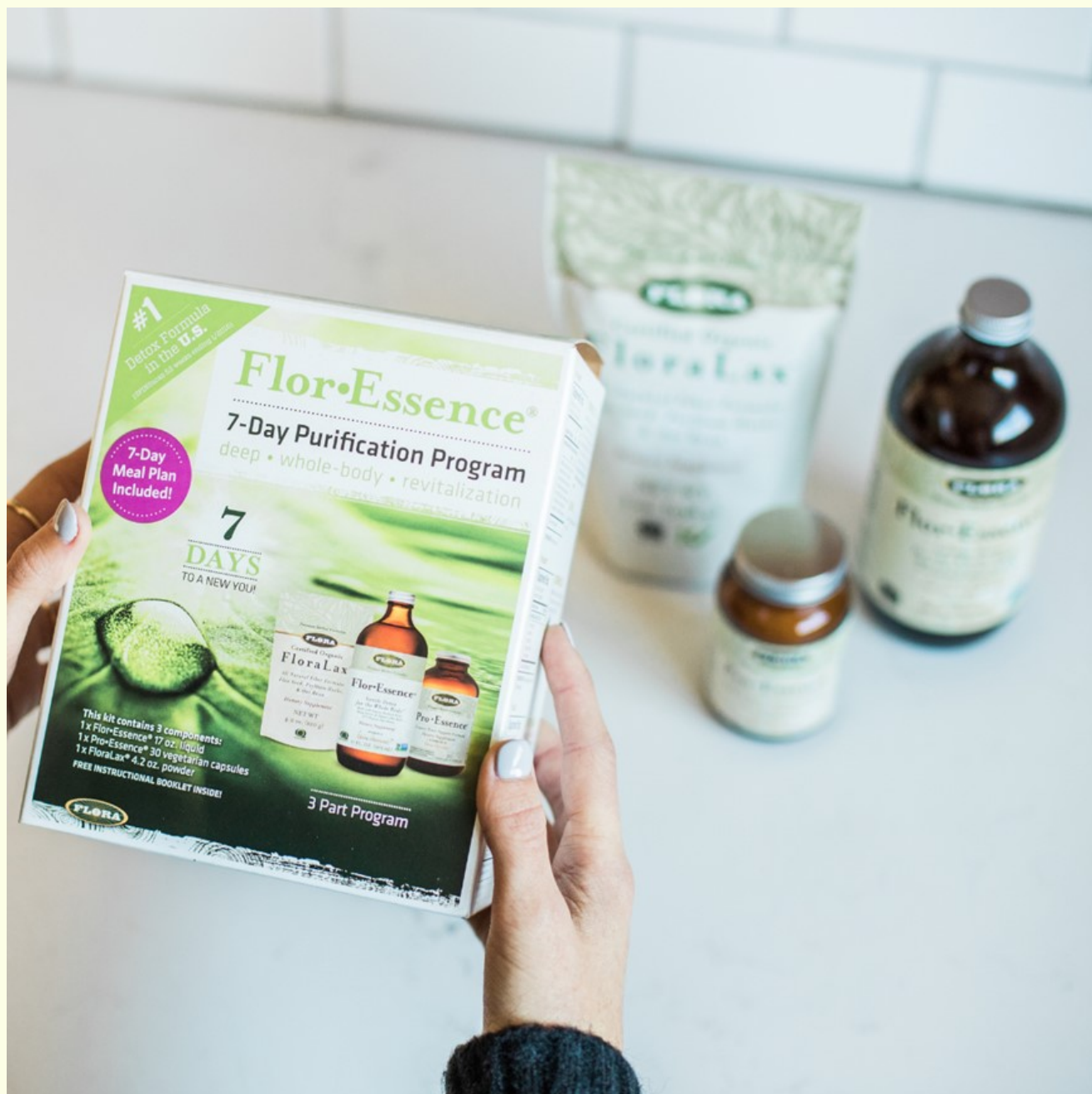
Flora Health Flor-Essence 7-day Purification Program