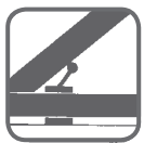
Electrical Limit Switch

Lifts in our Modified category can be equipped with any platform size up to 72" x 96" in 1" increments plus many of our most popular options* and ship in two weeks or less.**