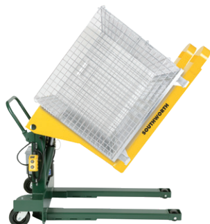
Portable Tilter PTU2