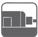
Larger Power Units