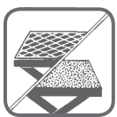
Anti-Skid Platform Surfaces

Lifts in our Modified+ category include all models from our Stock and Modified categories plus a wider range of options including those shown below and many more.* In many cases we can even do light customization and still meet the three week shipping window.**