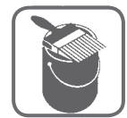
Special Paint Colors