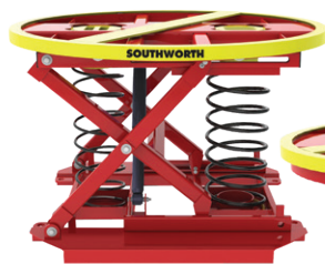
PalletPal 360 Spring PalletPal 360 Air