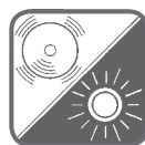
Visual or Audible Signals