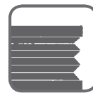
Bellows Accordion Skirting