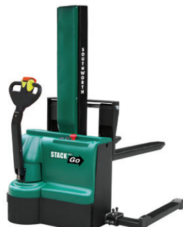
Stack-N-Go All Models