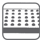
Ball Transfer Top