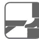
Bevel Toe Guard