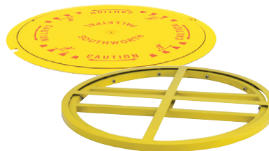
PalletPal Disc Turntable PalletPal Ring Turntable