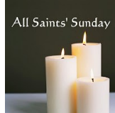
All Saints' Sunday

On November 6 , we will celebrate All Saints' Sunday, at the 11:00 a.m. service. There will be reserved seating for families of those we remember.