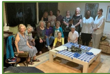
Culture and Cuisine Group Photo